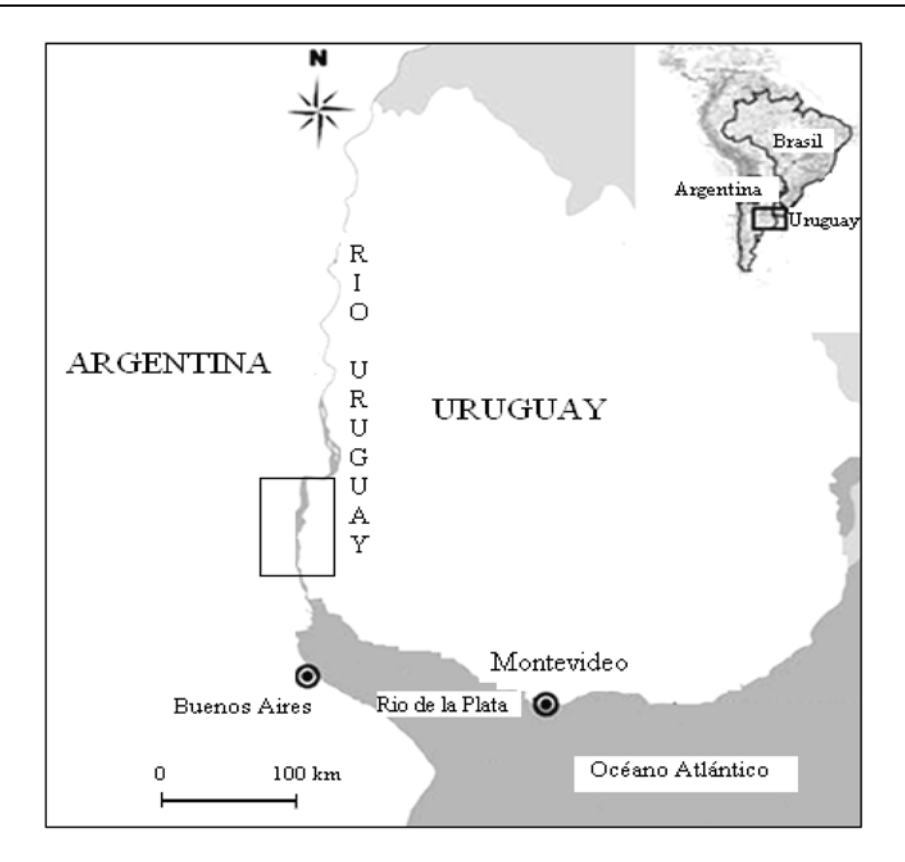
Figure 1. Map showing sites of sample collection at the lower regions of the Rio Uruguay.

differences between species by non-parametric statistics (Mann-Whitney test; p < 0.05). We followed the test according to Hoftman and Ratt [17]. For scoring the micronuclei the following criteria were adopted [18]: a) The diameter of the MN should be less than one-third of the main nucleus, b) MN should be separated from or marginally overlap with the main nucleus as long as there is clear identification of the nuclear boundary and, c) MN should have similar staining as the main nucleus.