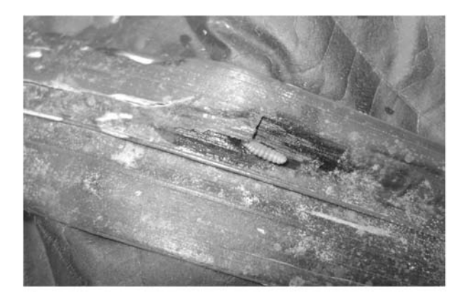
Figure 6. Typical damage caused by C. lameensis larva.

Leaf miner outbreaks are sporadic and difficult to predict (Figure 7). Control with pesticides has proven costly and beyond the means of small-scale oil palm producers [13]. Heavy infestations of C. lameensis can cause 90% defoliation which can subsequently lead to a 50% reduction in fresh