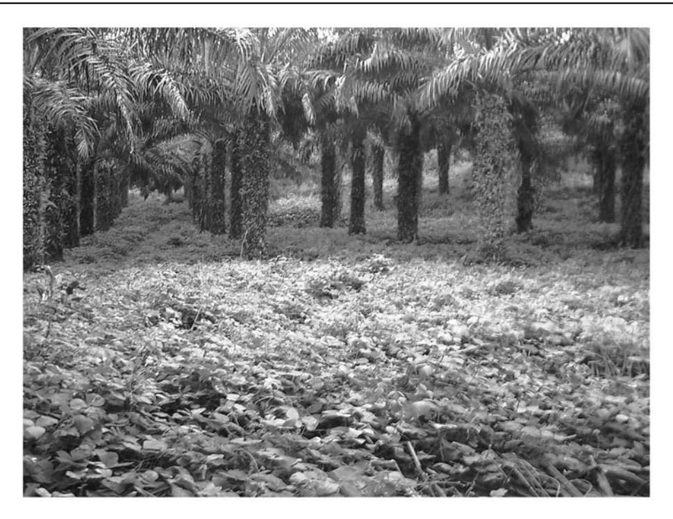
Figure 1. Oil palm plantation with cover crop beneath.

employment. [13] stated that oil palm allows many small householders and land owners in the rural areas to participate in the processing activities in the industry which generates income, since it is essentially rural-based and has positive impact on the standard of living of the people.