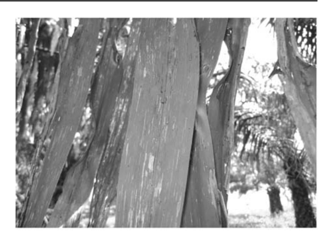
Figure 7. Typical outbreak situation of C. lameensis.

fruit bunches over the following two years [40] (Figure 8). [38] also reported that during heavy infestations only the central spear remains uninfested and the leaflets appear desiccated thus reducing photosynthetic activity of the leaves (Figure 8). Severe defoliations can lead to a yield decrease ranging from 30 to 50%, during 2 to 3 consecutive years, wrecking production [52, 5, 7]. It is difficult to control C. lameensis using insecticide due to their mining behaviour [31].