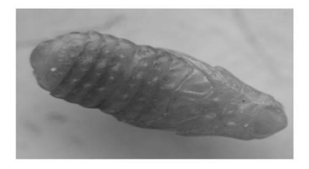
Figure 4. Pupa of C. lameensis.