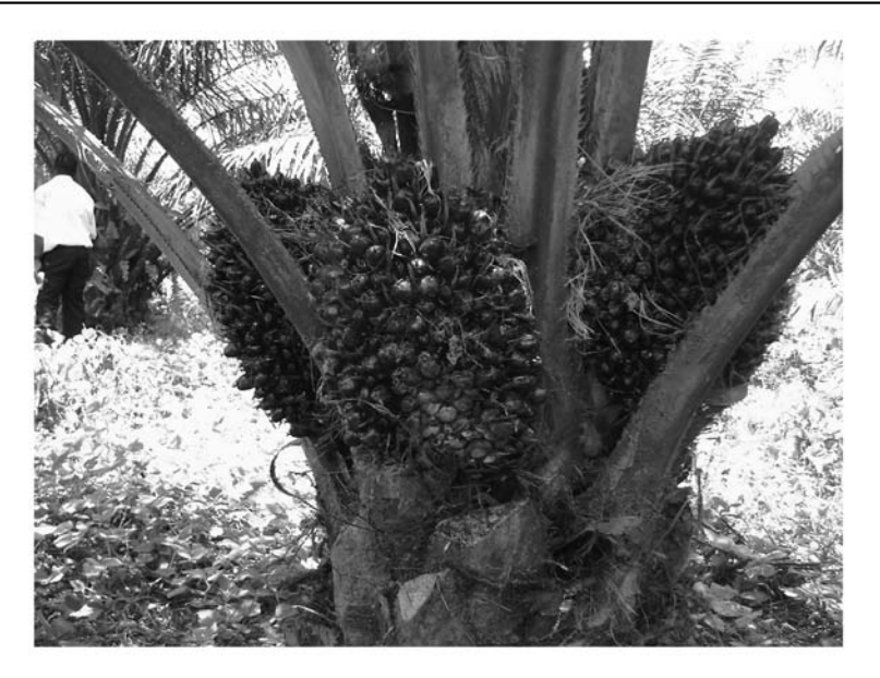
Figure 2. Oil palm tree bearing fruits.

the palm oil and palm kernel oils which are used in products all around the world [14]. These are common cooking ingredients in countries where they are produced. Oil palm production is 5 to 10 times more important than groundnut and soybean oil [20].