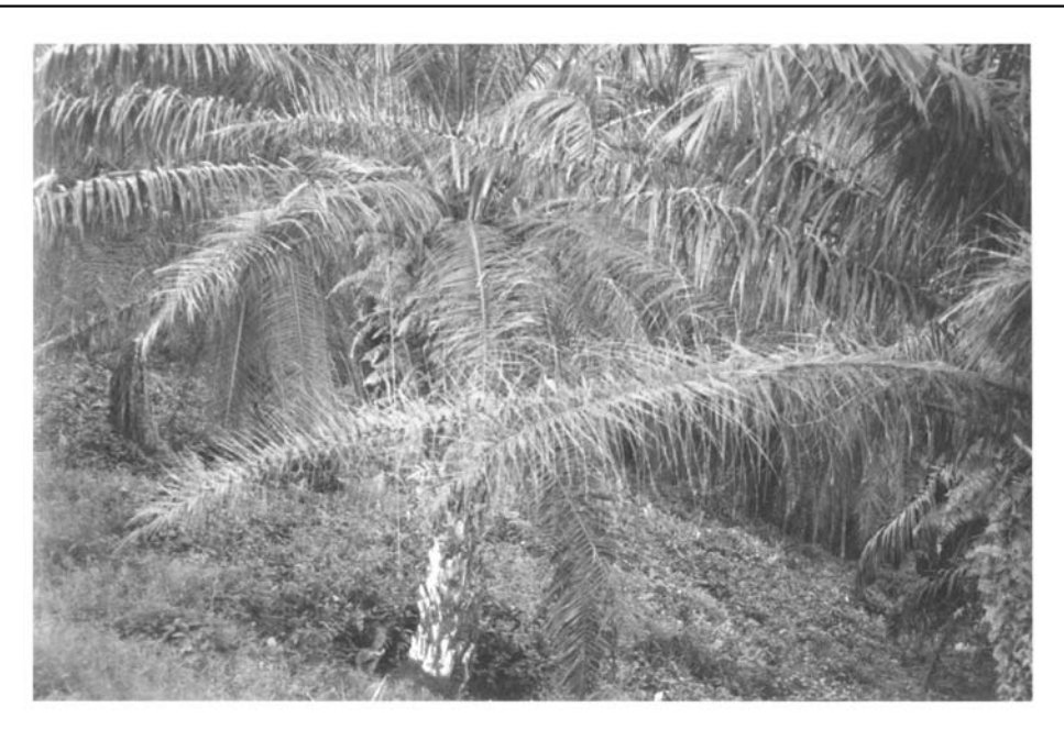
Figure 8. Heavy infestations with only the central spear remaining uninfested and the leaflets appearing desiccated.