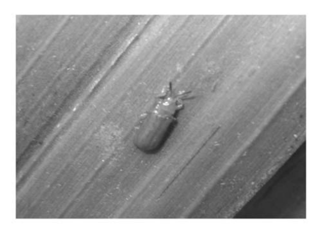
Figure 5. Adult of C. lameensis.